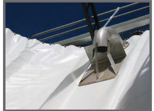
waterproof tanks with: internal piers, sumps, weirs, walls with step ins or step outs